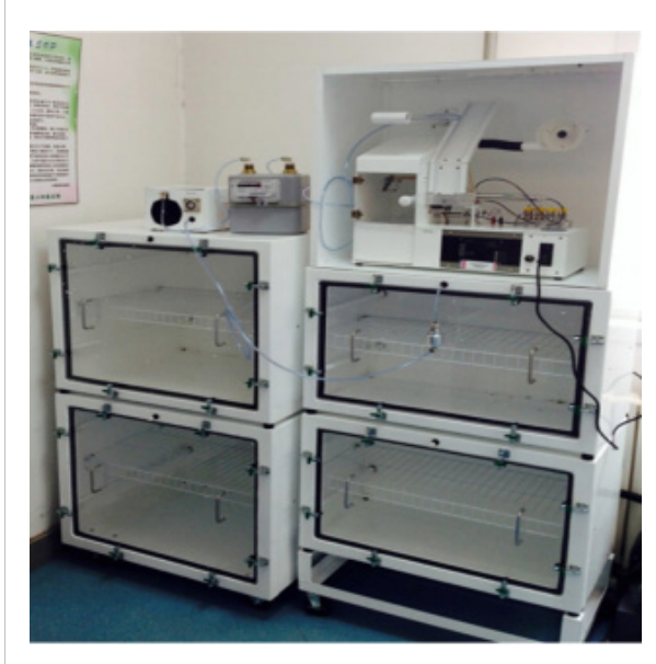
TE-10B Overseas System

Phone: (530) 406-8893 Email: steve@teague-ent.com 1237 E. Beamer St., Suite E Woodland, CA 95776