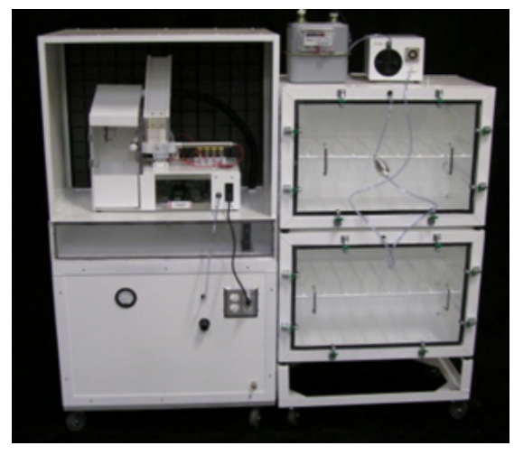
TE-10B US System with mouse chambers & TSP (total suspended particulate) Measuring System